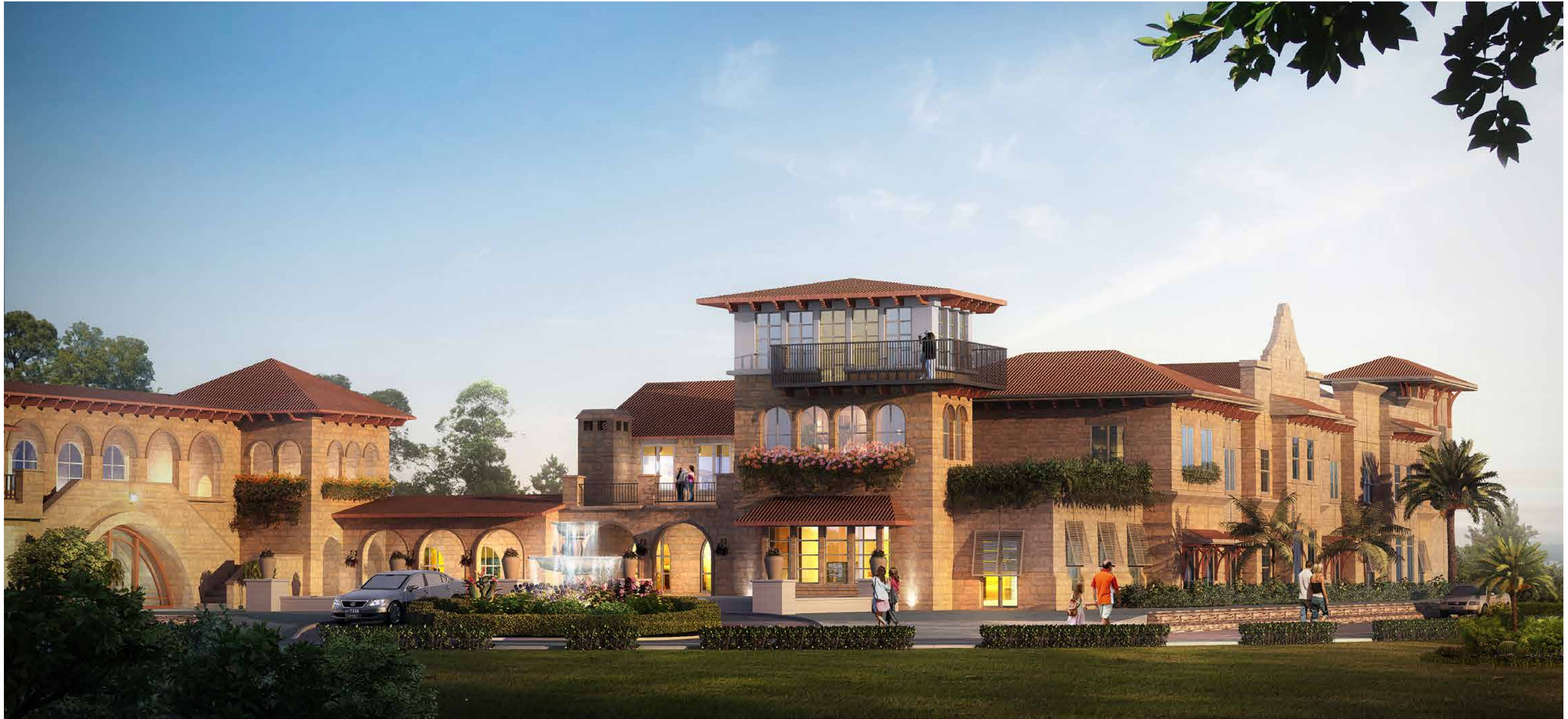
View Looking @ 2 Story Memory Care And AL Village Facility